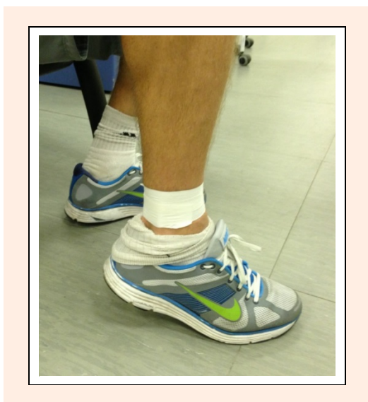
Figure 1. Achilles tendon taped to create the stride imbalance.

Methodology. CT and FT were computed as previously described from both treadmill (based the vertical