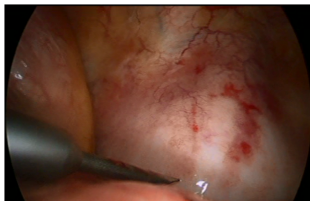
Fig. 3. Intra-operative view of the bulging parietal pleura.

Spondylodiscitis can be classified as pyogenic, granulomatous (tuberculosis, brucellosis, fungal) or parasitic. 1,4 The pathogenesis of pyogenic spondylodiscitis can be haematogenous, by external inoculation or