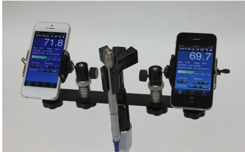
Fig. 1. (Color online) The SoundMeter app on the iPhone 5 (left) and iPhone 4S (right) compared to \frac{1}{2} -in. Larson-Davis 2559 random incidence type 1 microphone (center).