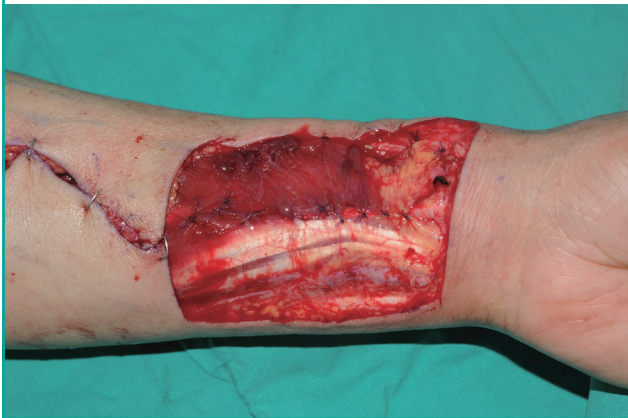
Fig. 2. Intraoperative tie-over dressing

The locations of the flexor carpi radialis and brachioradialis were approximated. The adjacent skin flap was advanced toward the defect, and the margin was quilted at the wound bed to fully define the space and encourage a minimal wound size. If the lateral antebrachial cutaneous nerve was exposed, the radial side of the skin flap was advanced over the lateral antebrachial cutaneous nerve for protection. Vicryl 4-0 sutures were used.