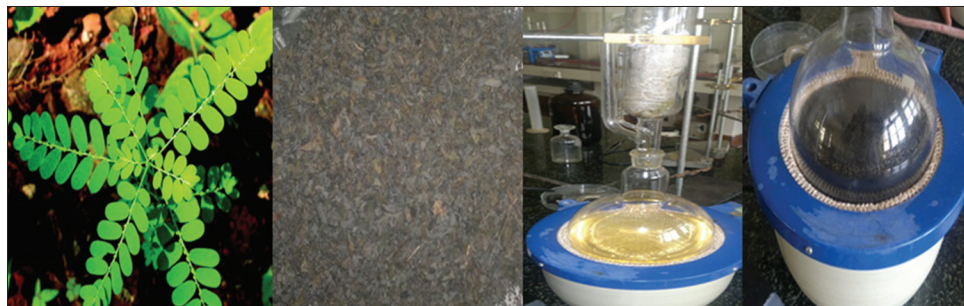
Figure 1: Preparation of Phyllanthus amarus ethanolic extract

Data were analyzed using one-way ANOVA, followed by Tukey-Kramer multiple comparison test with the help of InStat –Graph Pad software [GraphPad software Inc., CA, USA].