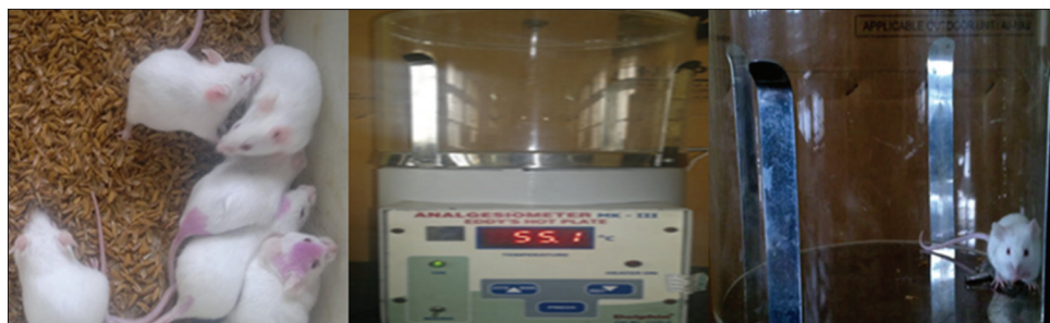
Figure 2: Eddy's hot plate test