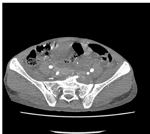
Fig. 3. (a) Computed tomography scan of the chest with contrast showing bilateral effusion with pleural infiltration, right upper lobe involvement, soft tissue lesion in the posterior mediastinum. (b) Computed tomography scan of the abdomen showing lytic lesions in pelvis and sacrum.