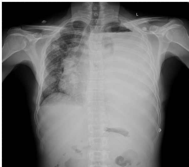
Fig. 1. Chest X-ray showing massive left side pleural effusion and right upper zone nodular opacity (small air pocket in left apex is due to previous aspiration).

The results of bacterial and mycobacterial culture were negative. Cytological analysis of the fluid revealed numerous plasma cells including some binucleate forms and plasmablasts (Fig. 2). On echocardiographic examination, left ventricular ejection fraction was 60% with no pericardial effusion. Bence Jones protein was found to be positive in the urine. Serum protein electrophoresis did not demonstrate an M spike and immunoelectrophoresis showed polyclonal gammopathy. After 3 days of chest drainage a CT scan of the chest and abdomen was done, which showed bilateral pleural effusion more on the left side.