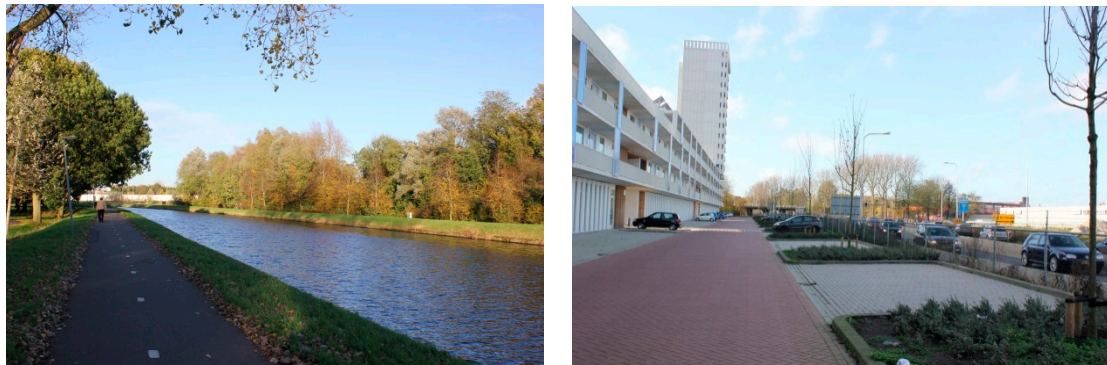
Figure 2. Impressions of green spaces in the two neighborhoods: Green space next to the highway in Corpus-Noord ( left ); and the highway next to the residential area in De Hoogte ( right ).

side of the neighborhood. Corpus-Noord also contains three main obstacles. A canal together with a highway are adjacent to the east side and another highway is on the northern side of the neighborhood. When looked at in more detail, the canal and the highway in Corpus-Noord maintain a suitable distance from the residential areas. A paved cycling road alongside the canal allows people to access the green spaces and it also provides a good recreational experience for visitors (Figure 2). By contrast, both the highway and railway in De Hoogte are very close to the houses and there are no facilities for them to be traversed, which makes it very difficult for residents to visit the green spaces on the other side of the highway and railway even though physically the green space is nearby.