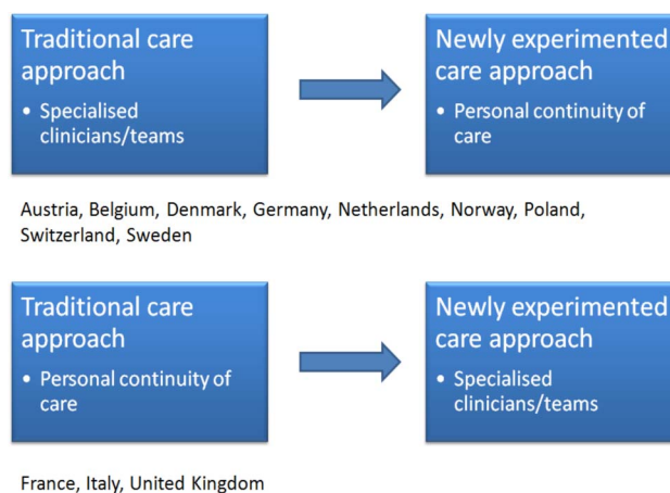
Figure 1 National reforms and changes in mental healthcare organisation.