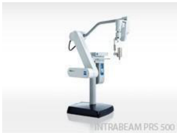
Figure 3 The Zeiss® INTRABEAM® (Carl Zeiss Surgical) PRS500 Electronic Brachytherapy System.

The INTRABEAM PRS500 electronic Brachytherapy System (Carl Zeiss Surgical, Oberkochen, Germany) is a mobile X-ray source that was initially developed to treat intracranial lesions and can be used to treat a variety of malignant lesions (Figure 3). 19 Like the Xofter Axxent, it can be used to treat