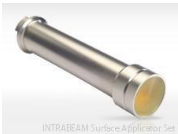
Figure 4 A surface applicator used for electronic brachytherapy with the Zeiss® INTRABEAM® (Carl Zeiss Surgical) PRS500 System.

skin, breast, and gynecological cancers, but also has a needle applicator that can be applied to treat spinal metastases. 15,19 The system consists of an X-ray source, a control console, a user terminal, and attachments to verify accurate treatment. Treatment times are entered into the control console, and one of the four flat applicators for surface treatment is attached to the probe and used to deliver the dose. Treatment times range between 5 minutes and 30 minutes. Applicators for surface treatment are available in 10 mm, 20 mm, 30 mm, and 40 mm diameter and can be sterilized and reused (Figure 4). 19 The miniature X-ray source, the XRS 4, measures 11 cm in length and has a 3.2 mm diameter probe. The SSD is variable between 9.6 mm and 21.6 mm based on the applicator size