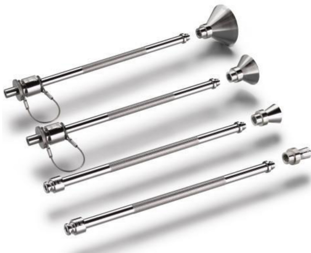
Figure 2 Surface applicators for the Xofter® Axxent® Electronic Brachytherapy System (iCAD, Inc.) of differing diameter size.

Note: Reproduced from Bhatnagar A, Loper A. The initial experience of electronic brachytherapy for the treatment of non-melanoma skin cancer. Radiat Oncol . 2010;5:87. 40