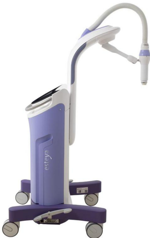
Figure 5 The Esteya ® Electronic Brachytherapy System (Elekta ® AB-Nucletron, Stockholm, Sweden).

The Esteya Electronic Brachytherapy System (Elekta AB-Nucletron, Stockholm, Sweden) was developed specifically for the treatment of skin surface lesions (Figure 5). 21 It consists of a treatment control panel with planning software, a treatment unit, and surface applicators. The applicator diameters for treatment are 10 mm, 15 mm, 20 mm, 25 mm, and 30 mm, and a 0 mm applicator is used for quality assurance