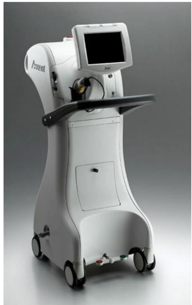
Figure 1 The Xofig ® Axxent ® electronic brachytherapy system (iCAD, Inc.) external trolley.

The currently available eBT devices are the Xofig ® Axxent ® , Zeiss ® INTRABEAM ® , and Elekta ® Esteya ® . The Xofig Axxent electronic brachytherapy system ® (iCAD Inc., Nashua, NH, USA) incorporates a 23 mm proprietary X-ray source with a multilumen catheter and is used in the treatment of skin cancer, early stage breast cancer, and gynecological malignancies (Figure 1). 15,16 It consists of a mobile controller that provides power and cooling to the source, a HDR X-ray source, and applicator sets. Superficial, NMSCs are treated using United States Food and Drug Administration (FDA) approved, lightweight surface applicator placed directly over the target lesion. Surface applicators measure 10 mm, 20 mm, 35 mm, and 50 mm in diameter with corresponding end caps (Figure 2). 15 Similar to radionuclide HDR brachytherapy, the miniature X-ray source can be stepped along the catheter