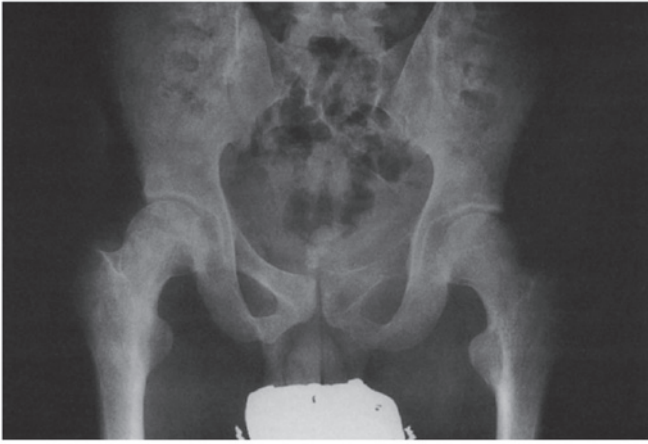
Figure 1. Plain radiograph revealing a lytic mass involving the left pubis, ischium and acetabulum.