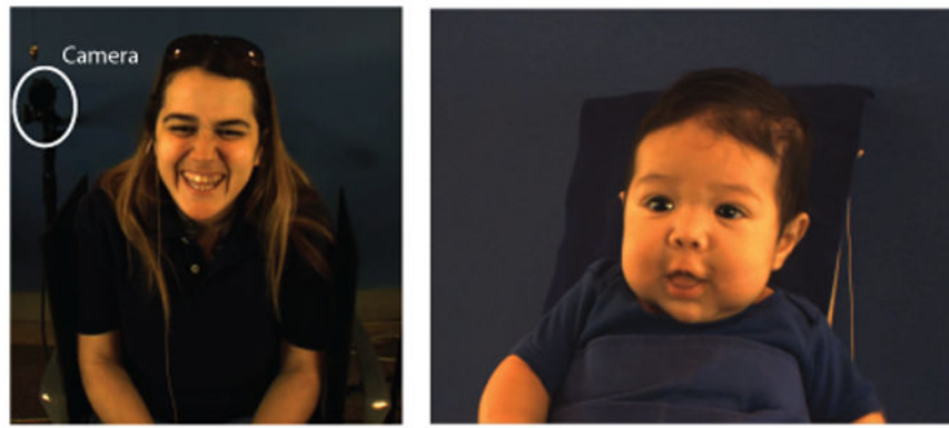
Figure 1. Face-to-Face interaction.