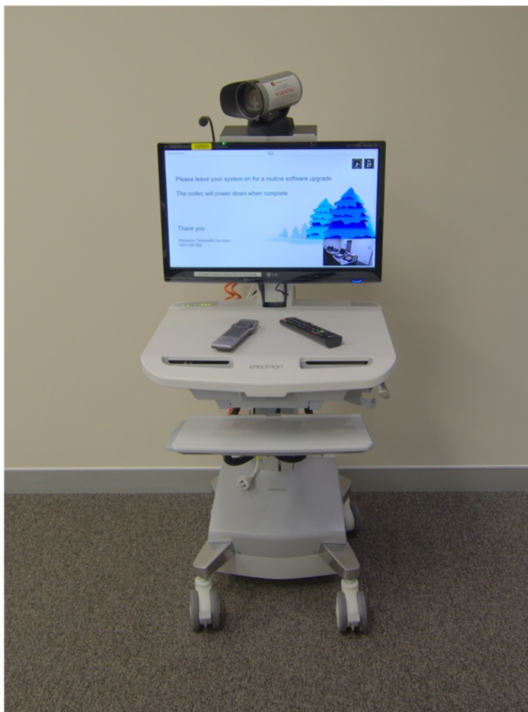
Fig. 2 A wireless videoconferencing trolley at a distal site

utilised: Data relating to number of telehealth service points, type of service (Video conference or store-and-forward), remote location of service (i.e. the town where the video conference is being received), speciality type (i.e. geriatrics), clinic times (start and finish, reoccurring). The data was extracted in blocks of three months commencing from July 2012 and continuing until 30 June 2014. Utilisation data (from the previous 12 months) prior to the commencement of the PAH-TC was sourced from the hospital administrative systems.