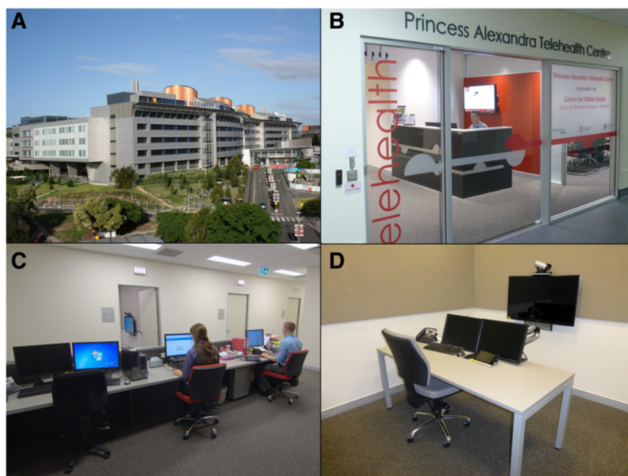
Fig. 1 Princess Alexandra Hospital Telehealth Centre - a Main building, b The Centre entrance, c Coordination desk, d Telehealth studio

After the establishment of PAH-TC, several onsite-tours were organised to introduce the centre, its functionalities and capabilities to the physicians and managers of various departments of the hospital as well as external parties. The clinicians who were already practising telehealth were invited to use the facilities available in the centre if preferable. The centre has administrative staff responsible for planning and coordinating telehealth services and streamlining telehealth booking processes. Other clinicians were also encouraged to establish a telehealth practice with the help of administrative and coordination services available. Telehealth clinics could be managed