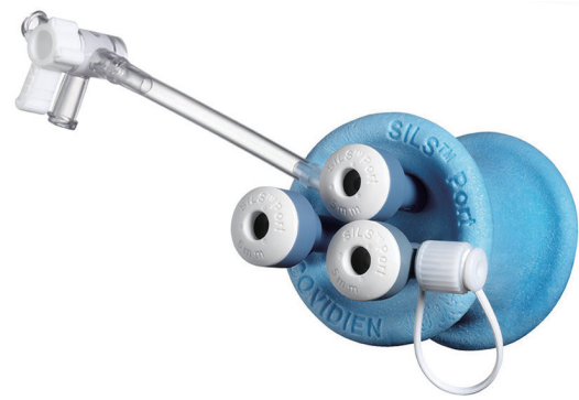
Figure 2 The Single Incision Laparoscopic Surgery (SILS) Port device.