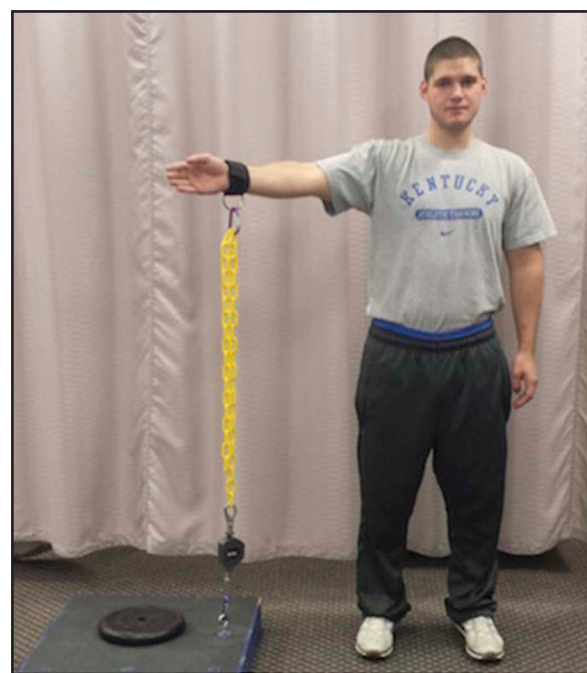
Figure 2. Testing position using portable load cell.

All participants were randomly assigned into one of two treatment groups; the traditional training group (group 1) or the Advanced Throwers Ten group (group 2). An independent investigator on the research team utilized Excel (Microsoft, Redwood, WA) to generate random numbers to create group assignment sequence. The random numbers corresponding to the treatment groups were placed in a