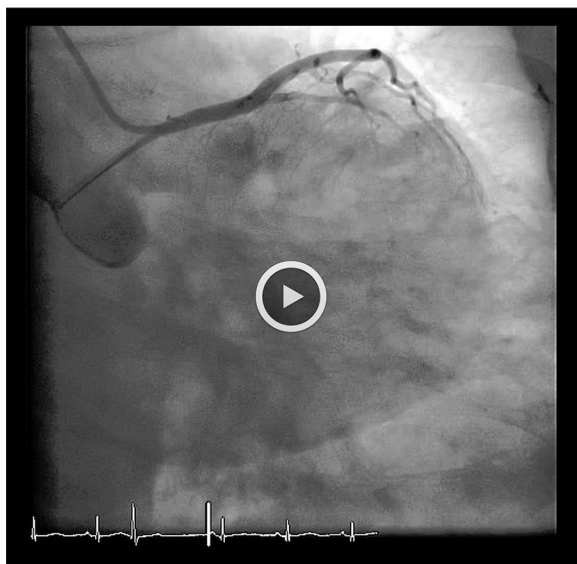
Video 1. Left coronary angiogram showing flow through the left main coronary artery and LAD, with absence of the LCX (corresponds to Figure 1).