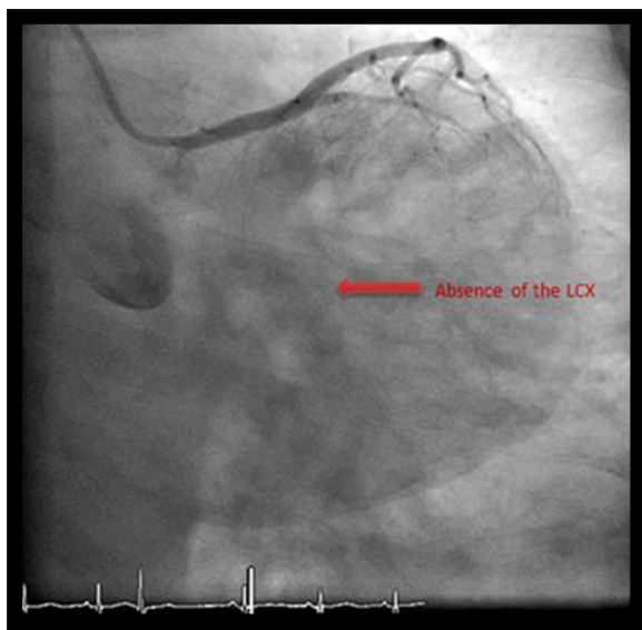
Figure 1. Left coronary angiogram showing absent LCX with a patent left main coronary artery and patent LAD (right anterior oblique caudal view).