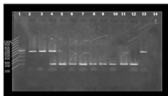
Fig. 3. Results of sea and seb genes amplification. Lane 1: 100 bp marker, Lane 2 and 3: seb positive strains (477 bp), Lane 4: sea + seb positive strains, Lane 5 to 11: sea positive strains (127 bp), Lane 12: positive control for sea gene, Lane 13: positive control for seb gene, Lane 14: negative control.