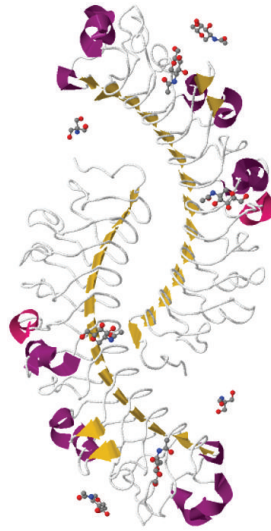
FIGURE 1: Structure of decorin : mammalian decorin (DCN) contains a monomeric protein core of 42 kDa and a single chondroitin/dermatan sulfate glycosaminoglycan (GAG) chain. DCN exists as a dimer in physiological solutions and is the best characterized member of the growing family of SLRPs. Structurally, it has a domain of tandem leucine-rich repeats (LRRs, altogether 12 LRRs), flanked on both sides by two cysteine-rich regions. Decorin dimer structure (from PDB 1XKU). Images prepared with JMOl program. The N-terminus is in the “middle” of the antiparallel homodimer.