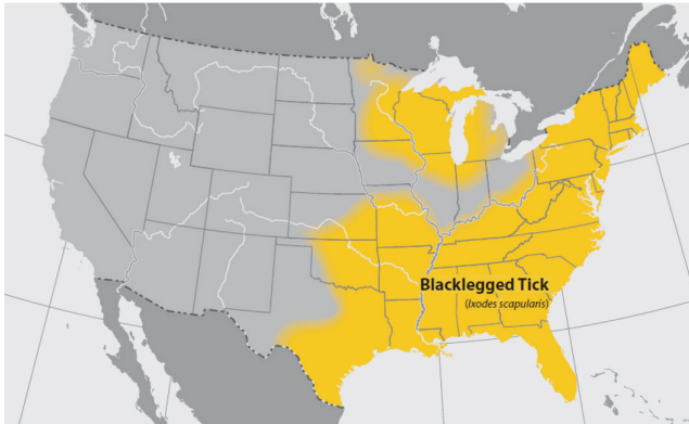
FIGURE 1: Geographic distribution of I. scapularis within the continental United States. Yellow shaded areas represent the distribution of I. scapularis in the northeastern and upper midwestern United States [2].

the transmission of B. burgdorferi to humans [2]. The current geographic distribution of I. scapularis in the United States is primarily in the northeastern, southeastern, and midwestern states (Figure 1).