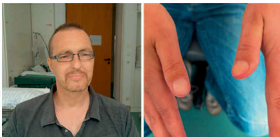
Fig. 1. Physical examination in warm antibody AIHA. Skin pallor, icterus and nailbed pallor in a patient with treatment-refractory warm AIHA, hemoglobin 4.8 g/dl (photographs courtesy of Professor A. Salama, with kind permission of the patient).

fever, pallor, jaundice, (fig. 1) hepatosplenomegaly, hyperpnea, tachycardia, angina, or heart failure.