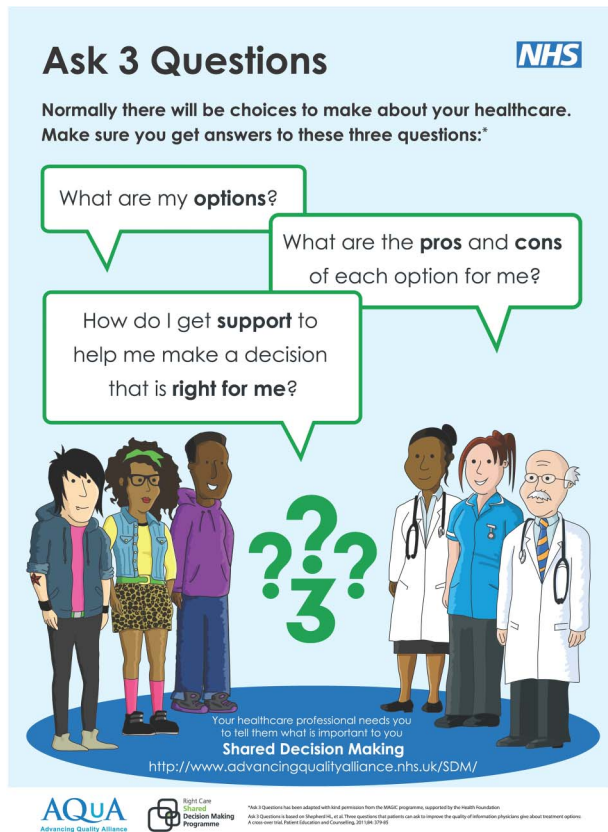
Figure 1 Ask 3 Questions.

knowledge and skills is justified. Some are prone to misrepresentation—accidentally or otherwise, this is readily identified through discussion and the underlying issues can then be addressed. The questionnaires also prompt appropriate engagement over potentially difficult issues such as sex and psychosocial concerns. Any issues that may arise are carefully addressed prior to transfer to adult services.