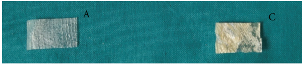
FIGURE 1: Lyophilized gamma irradiated amnion (A) and chorion (C) membranes, prepared to be used in periodontal therapy.

maintenance of biologic properties of membranes which is still the best way [9]. The amniotic membrane has gained importance specifically because of various factors. Firstly, it reduces scarring and inflammation and enhances wound healing. Secondly, it serves as a scaffold for proliferation and differentiation of cells owing to its antimicrobial properties. Thirdly, its extracellular matrix and its components, such as growth factors, suggest it to be an excellent biomaterial to act as a native scaffold for tissue engineering. Lastly, it can be easily procured, processed, and transported.