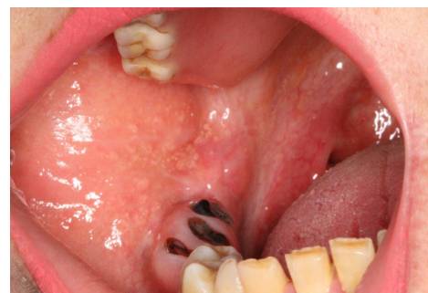
Figure 4. The third follow up after 6 months.