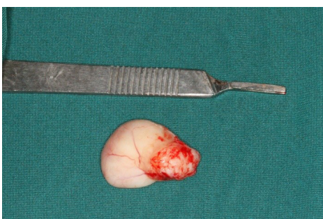
Figure 2. Inferior Aspect of the Specimen.