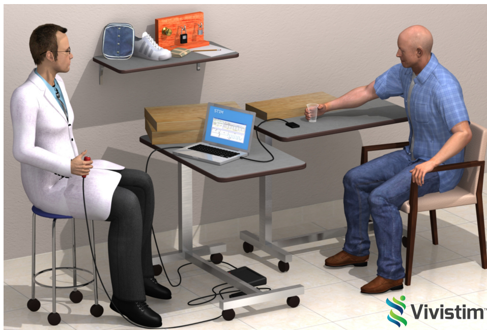
Figure 1. Schematic of vagus nerve stimulation device use in a typical therapy session.

with the Stroke Application Programming Software was used to program the IPG and initiate VNS. The stimulation was manually triggered by the therapist using a push button, while the patient performed a task (Figure 1). Stroke Application Programming Software allows the therapist to control the relative timing of stimulation to therapy exercises using the push button. The software also allows the physician to program the stimulation parameters (amplitude [mA], frequency [Hz], pulse width [ \mu S], and duration [ms]), captures patient programming history, and checks lead impedance and battery status. A 500-ms burst of VNS was delivered to the VNS group during each movement (the rehabilitation-only group did not have a device implanted). Each stimulation consisted of fifteen 0.8-mA, constant current, charge balanced pulses (100- \mu s pulse width, 30-Hz frequency). These stimulation parameters grew out of hypothesis-driven research in humans and animal models, 10–14 including studies of cortical map plasticity and electroencephalogram desynchronization using VNS. 12 Note stimulation was only delivered to the left vagus nerve to avoid activation of the sinoatrial node (which is innervated by the right vagus nerve), but bilateral neuronal connections mean stimulation should affect both cerebral hemispheres. Full details are given in the Methods in the online-only Data Supplement.