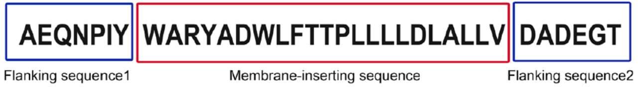
Figure 1. The sequence of pHLIP peptide.