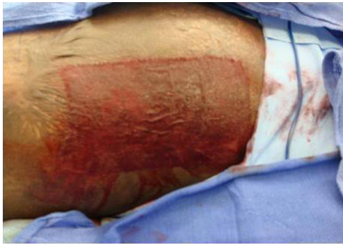
Fig. 6 Application of scarlet red to donor site wound

infections. As Scarlet Red dries, it shrinks and becomes tight over the donor area and this tightness makes ambulation and movement difficult and painful. Although absorption was good in this patients group, three Scarlet Red wounds required unplanned dressing changes because the dressings were soggy and lifted off the donor site. Delayed wound healing was seen in three cases. Wounds healed in 10–12 days. The Scarlet Red dressing is best for scalp donor site grafts. The open technique of leaving the wound uncovered is the least expensive but is very painful and associated with prolonged healing times. Patients seemed to complain most when the rolled gauze fluff was removed on the first post-operative day. The coagulum caused the Scarlet Red to stick to the gauze and removal was quite painful (Figs. 5, 6, 7, and 8).