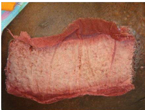
Fig. 7 Donor site at post-operative day 5

Helicoll Helicoll, on the other hand, was well tolerated by patients because of the absence of pain in the donor site and the resulting freedom of movement. Pain was reported on the fourth post-operative day, by eight of our patients, probably because of the degradation of the product and its incorporation into the wound leaving behind a closed wound. The first two cases initially had daily inspection of the wound bed to evaluate the wound healing progress, but this disturbed the rate of wound healing. None of the Helicoll patients had infections. A yellow gel observed on the