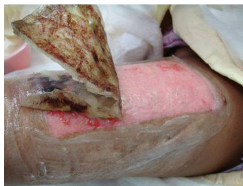
Fig. 12 Donor site dressing removal on post-operative day 8

is a semi-occlusive, self-adhesive collagen membrane with unique advantages of biocompatibility and flexibility. Because it maintains a physiologically moist environment at the wound surface and is biodegradable, it is associated with minimal post-operative wound pain. The traditionally used dressing for donor sites at our institution has been mesh gauze impregnated with Scarlet Red and a synthetic polymer, OpSite. These forms of dressings continue to be cost-effective compared with other types of dressings. Scarlet Red dressings are simple and the most commonly used dressing due to its easy availability, ease of application and low cost. It, however, is associated with delayed healing rates [24] when compared to other dressings. Problems include pain between and during dressing changes. There is even more pain if the dressing has to be removed after being incorporated into the healing site, as it does not always falls off easily. The dressing is adherent and associated with trivial trauma liable to damage the new epithelium [27, 28].