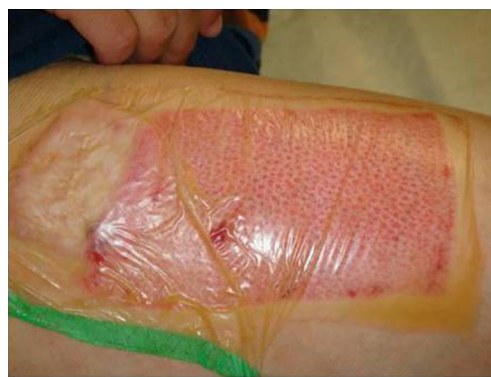
Fig. 4 Donor site wound on post-operative day 8

discharge under the wrinkled OpSite and required removal and daily dressing change with Adaptic and Bacitracin. Four patients had purulent exudates associated with redness. Patients were diagnosed clinically to have donor site wound infection, but no cultures were obtained. One patient developed a rash and two patients had dry crusts on the donor site. One patient had clots that were removed by making an incision in the OpSite. Six wounds healed in 7 days and four healed in 12 days. The transparent dressing appears to offer many advantages over opaque ones and gives a better follow-up of the donor site. OpSite promotes more rapid and less painful healing; however, it tends to be labor intensive, especially if associated with large fluid collection. This problem requires frequent dressing changes. It is our observation that fluid collections are best untreated and that wrinkled or dislodged OpSite should be removed to prevent infection (Figs. 1, 2, 3, and 4).