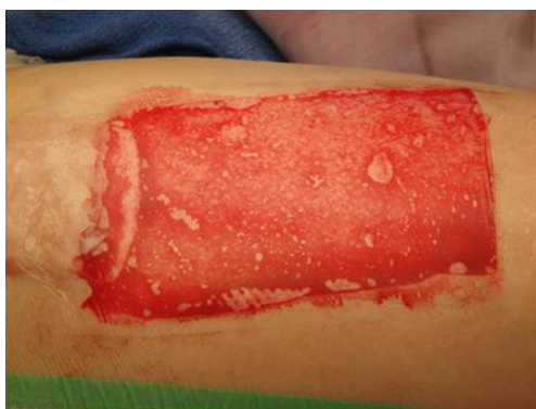
Fig. 2 Application of OpSite to donor site wound

that include comfort, pain level, ability to ambulate and an overall acceptance of the dressing. Relief from pain was the most frequently identified patient benefit. All patients in the Scarlet Red group (100%) had pain, only 25% in the OpSite group reported pain and none of the patients in the Helicoll group experienced donor site pain ( P < 0.05 ).