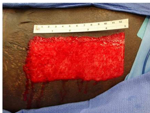
Fig. 5 Donor site at harvest

Patients with Scarlet Red experienced pain on the day of surgery, which limited their movement. Outer dressings were removed on the first post-operative day and it was allowed to dry. None of the patients with Scarlet Red had