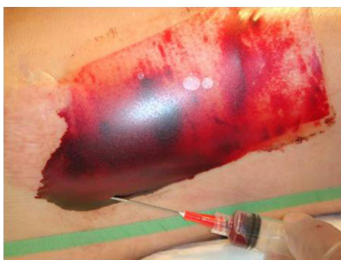
Fig. 3 Post-operative serosanguineous collection and attempt at its aspiration under sterile technique

OpSite Pain started on the fourth or fifth post-operative day in eight patients due to maceration of the wound attributed to fluid collection beneath the OpSite. Fluid collection was seen in all ten OpSite cases. Five patients required a small fenestration of the OpSite to drain the collecting fluid and a new film was used to reinforce the remaining parts of the original dressing followed by a secondary absorbent dressing to prevent constant leaking. Three patients had yellow