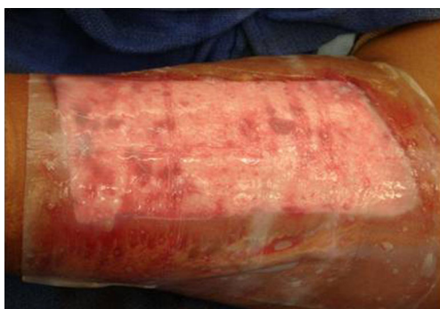
Fig. 10 Helicoll application to it followed by Adaptic and Bacitracin dressings