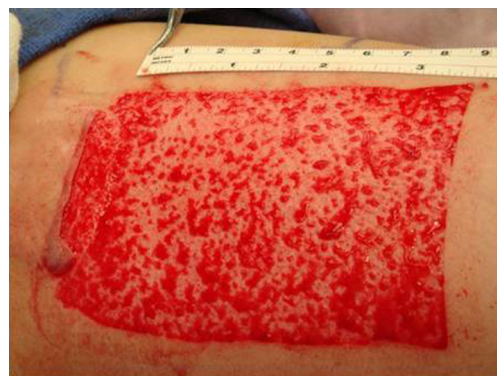
Fig. 1 Intra-operative pictures of donor site

All patients tolerated the dressings and no allergic reactions were observed. The wounds were assessed for characteristics