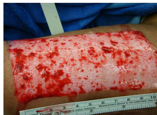
Fig. 9 Intra-operative picture of donor site

STSG donor sites often can be more painful and uncomfortable for patients than the recipient wound. In 1962, Winter [8] and Chang et al. [18–20] demonstrated that moisture enhances wound re-epithelialization and angiogenesis thus accelerating the healing rate. Transparent semi-occlusive dressing with a hydrocolloid base, such as Biobrane, allows fast, yet stable healing with reduced donor site pain but was associated with high infection rates secondary to exudate accumulation [21–23]. Another standard donor site management is to use an alginate dressing. These dressings desiccate and adhere tightly to the wound bed, making it difficult and painful to remove [24–26]. Helicoll is a reconstituted type I pure collagen sheet, derived from a bovine source and free of contaminants such as lipids, elastin or other immunogenic proteins. It