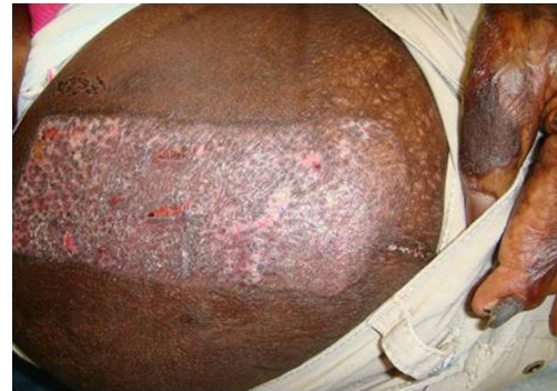
Fig. 8 Donor site at post-operative day 22

fourth post-operative day is due to the degradation of the product. Helicoll wounds healed in 7–10 days. The most valuable aspects of Helicoll include much greater patient comfort on the day of surgery and easier removal of dressings later on. This indicates indirectly the wound healing was significantly increased in the group treated with Helicoll (Figs. 9, 10, 11, 12, and 13).