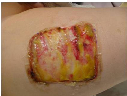
Fig. 11 Donor site on post-operative day 5; notice the incorporation of the product

The comparison of Helicoll with mesh gauze and OpSite on donor sites demonstrated a reduction in pain when compared to the traditional and time-tested approach. Other collagen dressings are available and are composed of types I and III bovine collagen. The difference between these collagen sheets and Helicoll dressing is that the collagen [32] provides a scaffolding for epithelial re-growth and prevents exudation from the raw area. After 48 h the film is transformed into a stiff sheet that is stable enough to withstand pressure and shearing from clothes. Thus, it protects the donor site from mechanical trauma and infection. When re-epithelialization is completed, the overlying film and coagulated blood separate spontaneously. Thus, removal of the dressing is easy and pain-free. If a donor site infection occurs, it would result in complete degradation of the film and is associated with significant donor site pain [4]. In contrast Helicoll, a type I pure collagen,