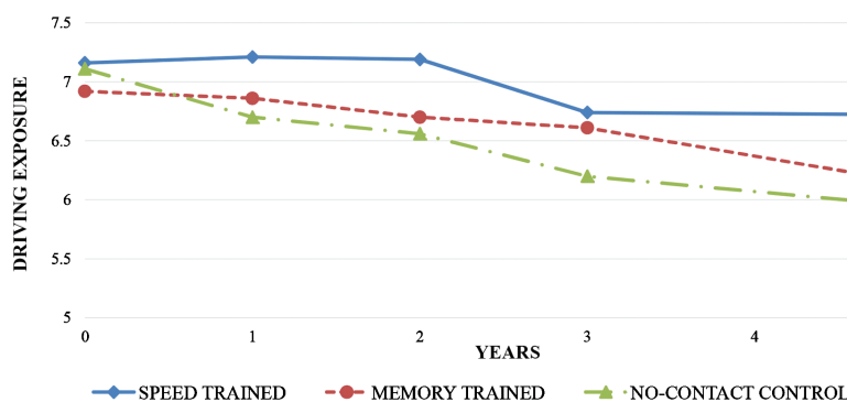
Figure 3. Driving exposure by training and control groups in at-risk participants who received booster sessions. Note: Driving exposure means are presented (range 0–8). Driving exposure was the sum of driving in challenging situations (e.g., driven alone, in the rain, etc.) over the previous 2 months. Training and control groups did not differ on baseline driving exposure (see Table 1, p > .05 ). Participants were at-risk for future mobility declines based on the baseline Useful Field of View Test score. Booster training occurred at years 1 and 3. Cohen's d for speed of processing trained group compared with no-contact control group was 0.60.

IADL, including driving, relative to social-contact control conditions (Ball et al., 2010; Edwards, Delahunt et al., 2009; Edwards, Myers et al., 2009; Edwards et al., 2005). Wadley and colleagues (2006) employed both a social- and no-contact control condition when examining SPT and found no differences between these two control groups, but enhanced processing speed among those who were trained as compared with either control condition. Finally, recent work has found that self-efficacy does not impact training gains in SPT (Sharpe, Holup, Hansen, & Edwards, 2014).