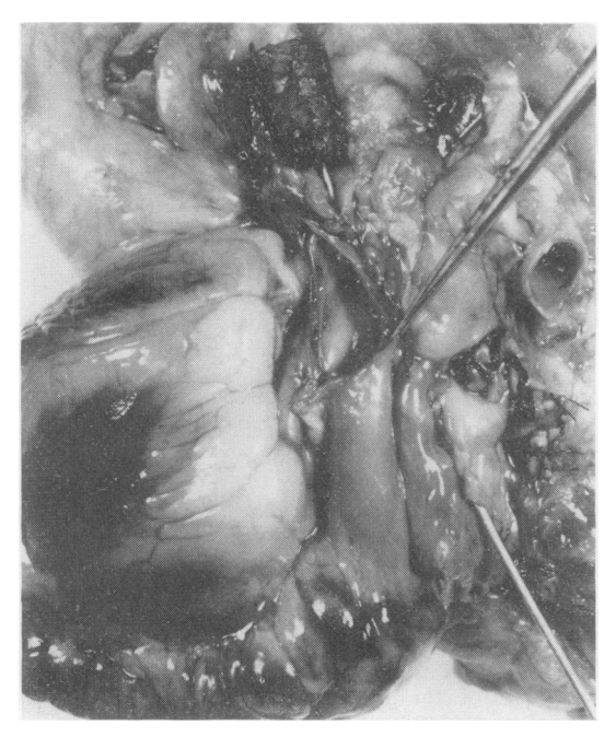
FIG. 1. Postmortem photograph showing the torn aspect of the inferior atriocaval junction. A metal probe can be seen passing from the inferior to the superior vena cava.

Necropsy did not show any further secondary deposit. The heart had been repositioned but it could be dislocated readily. When this was done the superior vena cava and pulmonary artery were twisted and considerable tension was exerted at the medial aspect of the inferior vena cava-right atrial junction where the tear was located (Fig. 1).