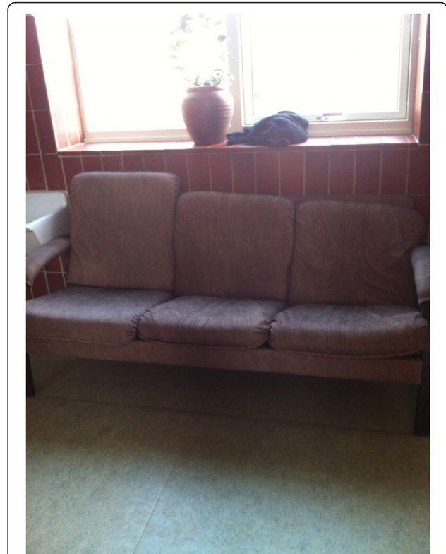
Fig. 1 Anna's photo of a couch in the corridor where she preferred to stay during recess talking with her friends

Some of the least physically active girls also favoured smaller secluded areas fitted with seats for talking and socialising such as a couch in the corridor or a seating arrangement in a corner of the library. The girls perceived these smaller areas as cosy and relaxing places where they could talk about girl-stuff or read a book undisturbed (see Fig. 1).