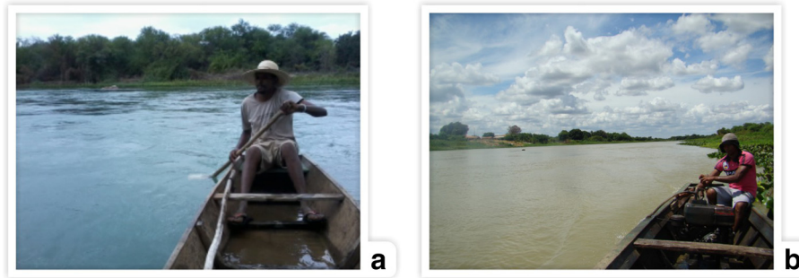
Fig. 3 Fishing canoe. (a) Paddle; (b) Diesel engine

decline of fishing stocks in the sub-middle São Francisco River. The introduction of exotic species in fresh water environments has been recognized as one of the greatest impacts to native species throughout the world [78–80]. In the case of the São Francisco River, several species have been introduced, and as indicated by the statements of the interviewees, these introductions have impacted the native species and caused changes in the traditional fishing activity of riverine populations. The species cited by the fishers included the butterfly peacock bass ( Cichla ocellaris ) and South American silver croaker ( Plagioscion squamosissimus ). These species were introduced to the Sobradinho Hydroelectric Plant Lake by the National Department of Works Against Drought (Departamento Nacional de Obras Contra as Secas-DNOCS) at the end of the 1970s [37]. In addition, many other species have been introduced species from fish farming experiments in the region, such as the oscar ( Astronotus ocellatus ) and tambaqui ( Colossoma macropomum ), generating