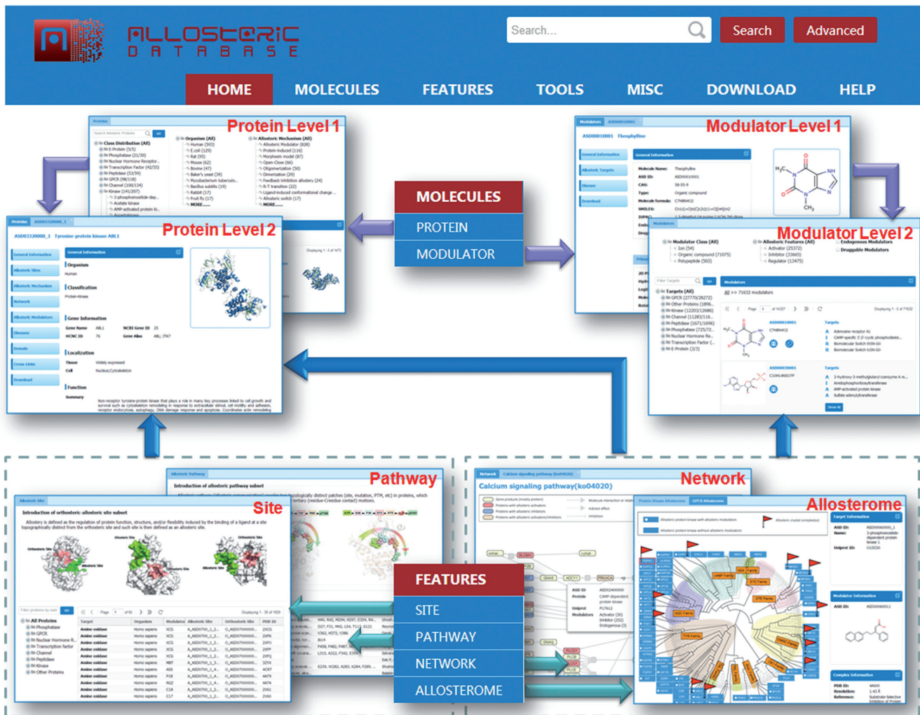
Figure 1. The new web interface and data architecture in ASD 3.0 are depicted.

position of allosteric apo/holo paired structures in ‘Glutamate racemase ( Helicobacter pylori )’ is displayed. Conformational transitions in allosteric site upon binding of the corresponding allosteric modulator ‘KRH’ are identified in ‘backbone’ and highlighted in color. The alignment and identified conformational transitions can also be downloaded as a PyMOL session (PSE) file in the page for further analysis. Of the 1688 allosteric apo/holo paired structures, 92.6% and 5.9% allosteric sites showed local motions in backbone and in sidechain, respectively upon the binding of modulators. Remarkably, 20 allosteric proteins can be regulated by the actions of both agonism and antagonism on the same allosteric site, such as glutamate dehydrogenase (bovine) (54,55). The apo/holo results revealed that the opposite mechanisms into one allosteric site occur by triggering different hotspots of the site, raising great challenges in allosteric drug design.