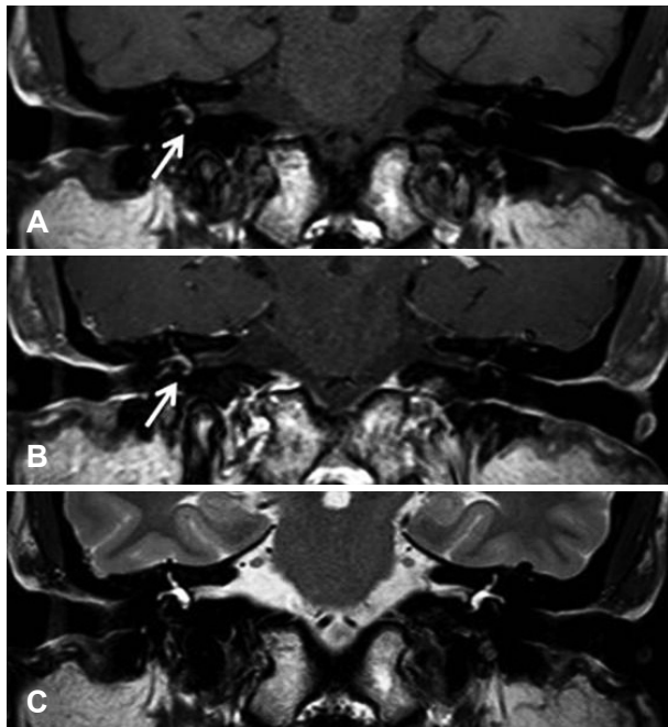
Fig. 2. Internal auditory canal MRI scans. A: Pre-contrast T1-weighted coronal image shows a hyperintense signal from the right vestibule (arrow). B: After contrast administration, increased signal intensity is maintained from the right vestibule (arrow). C: T2-weighted coronal image shows almost same signal from right and left labyrinth.

right vestibule, especially on the pre-contrast T1-weighted image (Fig. 2A) and also maintaining on the contrast-enhanced T1-weighted image (Fig. 2B). The signal intensity was equally