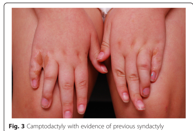
Fig. 3 Camptodactyly with evidence of previous syndactyly