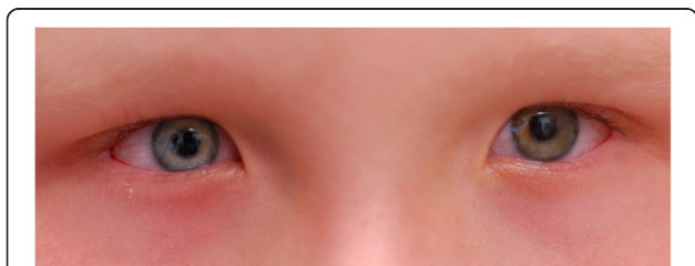
Fig. 1 Prominent epicanthic folds

The patient continues to have acceptable IOP in the low teens with retention of poor vision OS, 4 years following implantation of the tube shunt implant in her left eye. Her IOP and vision OD have been stable and acceptable in the low to mid teens for more than 6 months following the aqueous shunt implantation in her right eye with 20/25 best- corrected visual acuity, and a full