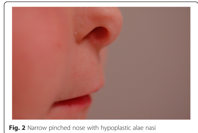
Fig. 2 Narrow pinched nose with hypoplastic alae nasi

Her left eye IOP and vision remained stable since her initial tube shunt placement, and her right eye IOP ranged between 13 mmHg to 19 mmHg on timolol 0.5 % and latanoprost 0.005 %. However, three-and-a-half-years post glaucoma implant in her left eye, her right eye IOP suddenly was 32 mmHg by applanation, while her vision remained unchanged at 20/25. This IOP elevation was found 5 months after a stable interval visit with acceptable IOP. Fixed- Combination timolol 0.5 %-brimoninidine 1 % was added to her regimen to replace