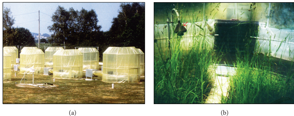
FIGURE 1: (a) Open-top chambers (OTCs) were located at Montardon site (10 km north of Pau, France). Technical characteristics of OTCs, close to those described by Heagle et al. [32, 33], have been already reported [34]. Each circular OTC had a diameter of 3 m and an open-top diameter of 2 m and was 2.8 m tall. It consisted of a galvanised iron frame covered with a polyethylene foil (Deltatex T2E). Ozone-free air (filtered air) or O_3 -enriched air was blown all around the chamber above the canopy level. The flow rate was controlled to achieve an air exchange rate of 3.14 times per min at the canopy level. When supplied, extra ozone was generated by electrical discharge of pure oxygen and injected into the air stream. Extra ozone was equally released only from 10 a.m. to 5 p.m. (GMT) in order to simulate the normal period of ozone exposure. The control chamber received filtered air (before ambient air was blown in the chamber, it passed through a charcoal filter that removed almost totally ozone), while, in O_3 -enriched OTC, O_3 concentration reached 100 \mu\text{g}/\text{m}^3 . Ozone was sequentially monitored in the three OTCs with an UV ozone analyser (Environnement SA, O_3 41 M) under the control of a computer recording system. (b) Inside a filtered air chamber: in the foreground mature Dactylis glomerata plants with inflorescences can be seen. The air suction device of the OTC allowing measurement of the ozone concentration is noted with a red arrow.

small particles increased when the pollen source was humidified (Figure 3(b), blue lines). This is likely the result of the release of subfragments and/or internal granules. Interestingly, while no effect of the exposure to \text{NO}_2 (0.5% during 10 min) was observed on birch pollen (Figure 3(b), red dotted line) it could induce a 10 times increased emission of number of particles smaller than 500 nm for Cupressus sempervirens pollen (red continuous line). These submicronic particles likely corresponded to orbicules which are located on the outer surface of the pollen and are a hallmark of cypress pollen grains. This experiment strongly suggests that \text{NO}_2 is able to strip off orbicules from pollen grains and thus release them as free subparticles in the atmosphere [195]. Inner subparticles from birch pollen grains were also shown to be released upon impaction on a solid surface at wind speed of about 3 m/s [196, 197].