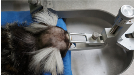
Figure 2. The marmoset in a stereotaxic frame for 6-OHDA injection.

hemisphere in the animals leaves the unlesioned side as an internal control, hence, fewer animals are needed in experiments to analyze behavioral deficits [9]. Along with less postoperative care for animals, local 6-OHDA treatment can minimize the risk of inadvertent toxic exposure for researchers associated with systemic MPTP treatments [49,64,65].