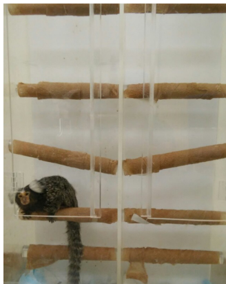
Figure 3. The marmoset in the tower setup.

performed in a double-blind manner by watching post hoc video-recordings of the animals accompanied by recording spontaneous locomotor activity in the lesioned animals [74]. Behavioral tests provide an external measure of PD-like pathology when assessing PD lesions in animals [71]. Evaluation of Parkinsonian features in marmosets can be conducted by a variety of behavioral tests ranging from simple food-retrieval task to a comprehensive neuropsychological assessment, including cylinder test, tower test (Figure 3), bungalow test, hand-eye coordination test, fear-potentiated startle response, rotation test, conveyor belt test, adhesive labels, reaching into tubes, staircase, hourglass test, bar grip power, and treadmill test (Table 4) [58,75-83].