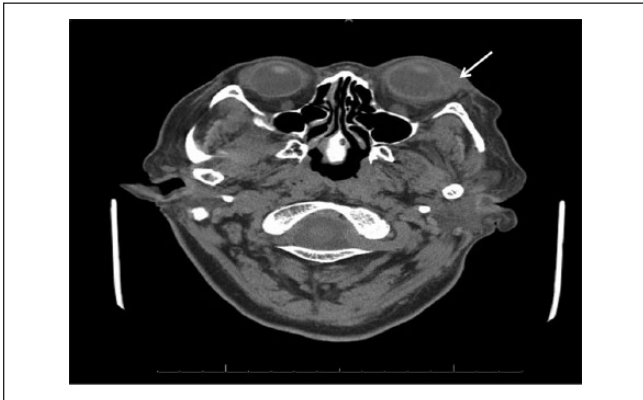
Figure 2. Abnormal intraocular enhancement of the left globe involving both the posterior and anterior chambers consistent with active endophthalmitis (arrow).

from the left eye. A CT scan of the orbits showed a detached retina on the left with opacification and endophthalmitis (Figure 2).