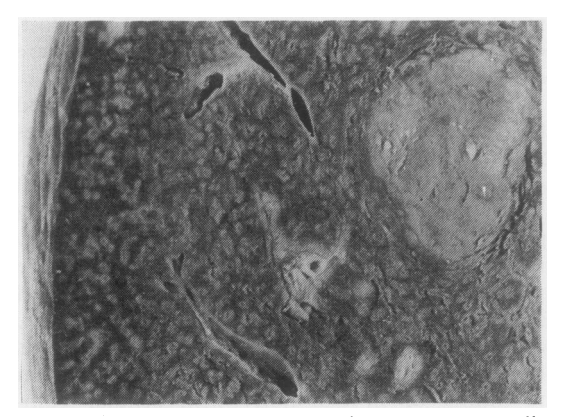
Fig 2 Liver showing pronounced "nutmeg pattern" of severe venous congestion. Nodule of adenomatous hyperplasia to right (\times 3.5) .

The liver was small (956 g) and on section showed a pronounced nutmeg pattern of centrilobular venous congestion with multiple, sharply-defined white areas of adenomatous hyperplasia (fig 2). There was no evidence of cirrhosis. A patent portal vein could not be found; sections through the porta hepatis showed cavernomatous transformation. The site of the lienorenal shunt was found to be occluded, and numerous varices were present.