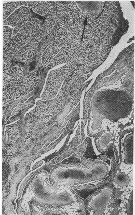
Fig 1 An area from edge of tumour. In lower right corner is typical cartilage-containing hamartoma. Arrow shows typical malignant tumour tissue surrounding an island of cartilage. Haematoxylin and eosin \times 25 (original specification).

The round tumour consisted of chondromatous islands separated by loose, partly myxomatous connective tissue with areas containing fat cells, and clefts lined with small cylindrical or cuboid epithelial cells. Cilia were seen in some places on the surface of the epithelial cells. About three-quarters of the tumour consisted of this typical hamartoma-like picture, and the periphery was here well demarcated and surrounded by compressed lung tissue.