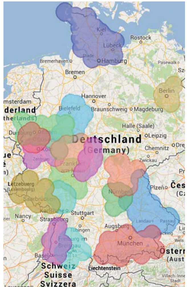
Figure 2: Distribution of 17 established trauma networks (TNW) that had been certified by mid-2011 and their coverage areas. Color coding is provided for clarity only