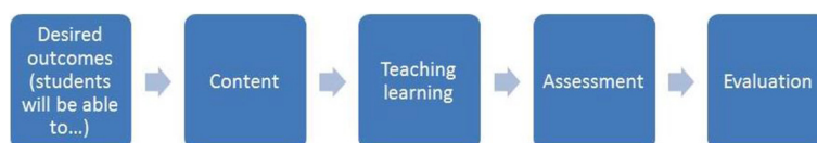
Fig. 2 Steps for developing training program content, adapted from Prideux 2003 [29]

The program will then be offered across Monash Partners and affiliated organisations. Translation to the other three Academic Health Sciences Centres is also planned.