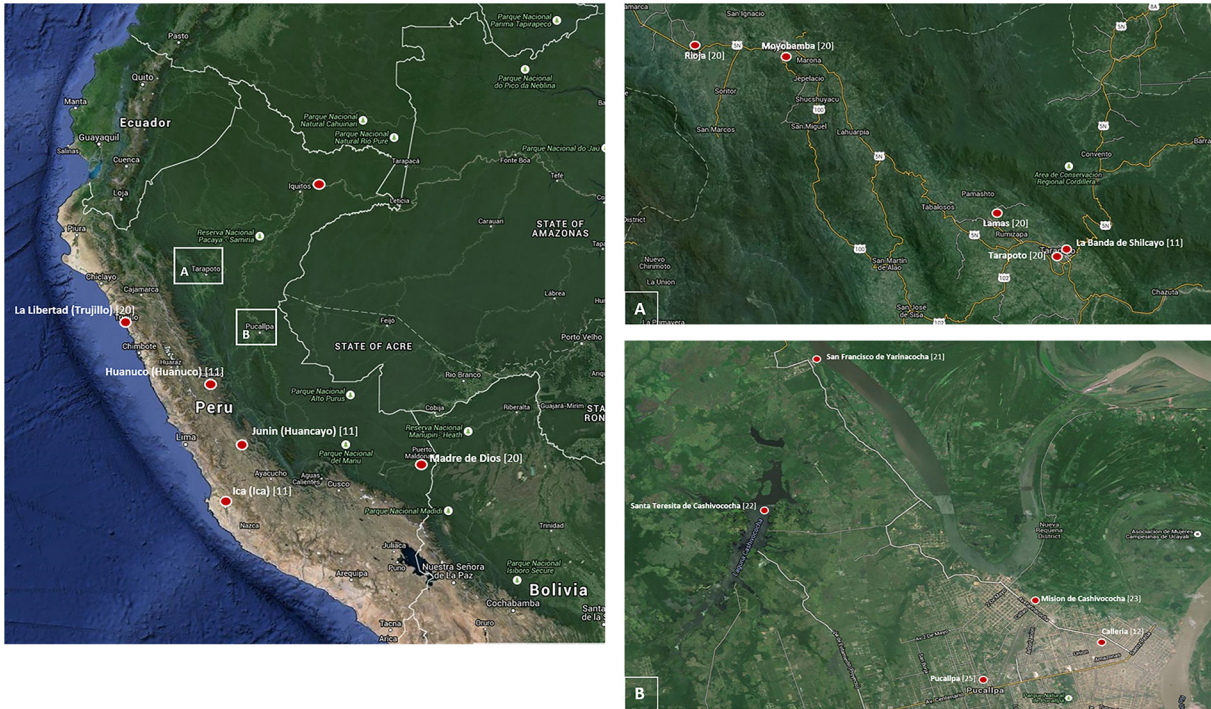
Fig 1. Map of Peru with geographical areas where trachoma was reported after the 1980s. Only included are the studies that reported more than ten individuals with any sign of trachoma. Areas (o) in the main map denote the department of Peru, followed by the district or community in parentheses and its reference in brackets. (A) Magnification of the department of San Martín showing five districts or communities and references in brackets. Surveys performed between 1983 and 2000. (B) Magnification of the department of Ucayali showing five districts or communities and references in brackets. Surveys performed between 1985 and 2001.