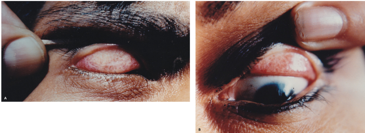
Fig 3. Pictorial evidence of endemic trachoma in Peru. (A) Everted upper eyelid showing scarring trachoma (TS) in an individual from San Francisco de Yarínacocha in 1985 [21] and (B) in another individual from Santa Teresita in 1986 [22], two indigenous Shipibo-Conibo communities settled along the banks of the Ucayali river, Pucallpa, department of Ucayali. The field studies were performed from 1983 to 2001 and were led by one of the authors (CW).