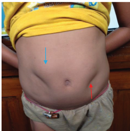
FIGURE 2. Lipoatrophy and lipohypertrophy on the abdomen in case 2. Red arrow, lipoatrophy; blue arrow, lipohypertrophy.

tion site, her blood glucose levels and glycemic variability improved. After 3 months, her A1C was 7.6%.