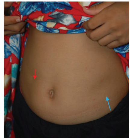
FIGURE 1. Lipoatrophy and lipohypertrophy on the abdomen in case 1. Red arrow, lipoatrophy; blue arrow, lipohypertrophy.

A 12-year-old girl with type 1 diabetes for the past 3 years presented