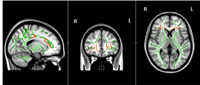
Fig 2. White matter areas with significantly decreased fractional anisotropy (FA) in PD (n = 40) versus non-PD peers (n = 40) corrected with threshold free cluster enhancement. Areas with significantly decreased FA are shown in colors ranging from red to yellow ( p < 0.05 , corrected for multiple comparisons). Voxelwise group comparisons of FA were carried out using TBSS (Tract-Based Spatial Statistics, part of FSL). TBSS projects all participants' FA data onto a mean FA tract skeleton (shown in green), before applying voxelwise cross-subject statistics. MRI conducted within 24 hours of cognitive testing. R = Right; L = Left.