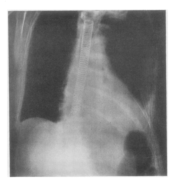
FIG. 2. The Gourevitch tube in position.

by malignant mediastinal nodes. Two cases of benign stricture unsuitable for a more radical procedure have also been satisfactorily intubated.