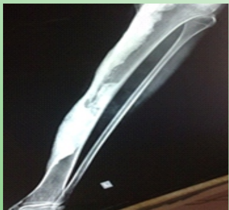
Figure 1: Full Length Leg Bone AP View X-ray.