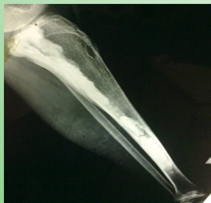
Figure 2: Full Length Leg Bone Lateral View X-ray.

begins in childhood. Most common symptom is pain and onset of disease is insidious [2]. Most common part of bone is diaphysis of the long bone of lower limb rarely the axial skeleton. It may also present with limb-length discrepancy, joint stiffness, progressive deformity, ossification in adjacent soft tissues[3]. The exact cause of disease still remain unclear.