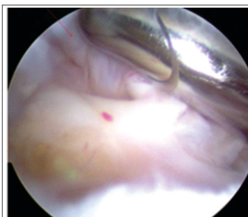
Figure 4: Pre-debridement arthroscopic view showing yellowish content in the anterior cruciate ligament.