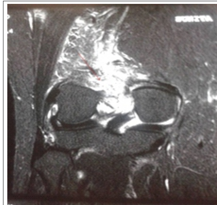
Figure 3: Coronal T2 weighted fat suppressed fast spin echo image showed complex anterior cruciate ligament ganglion cyst arising from superior aspect of ligament.

thickening of the ACL (Fig. 1). The ACL shows a normal orientation with preserved fibers and homogeneously increased signal intensity. The slice demonstrates an ill-defined ACL with diffuse increased signal intensity.