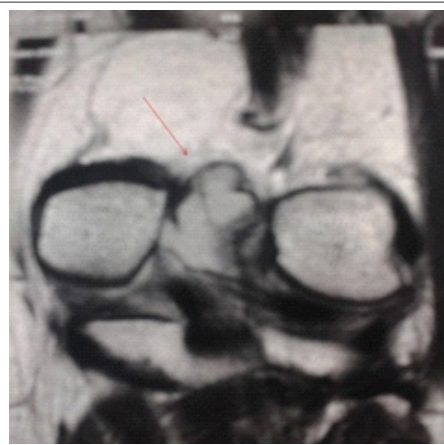
Figure 1: Coronal proton density-weighted magnetic resonance imaging shows a thickening of the anterior cruciate ligament.