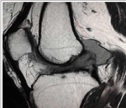
Figure 2: Sagittal proton density-weighted magnetic resonance image shows ill-defined anterior cruciate ligament with increased signal intensity and a "celery stalk" appearance of intact fibers.