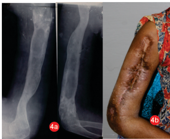
Figure 4:a- One year post surgery radiograph showing good continuity of the bone with no signs of active infection. b-clinical picture showing good wound healing

Extensive diaphyseal osteomyelitis can lead to