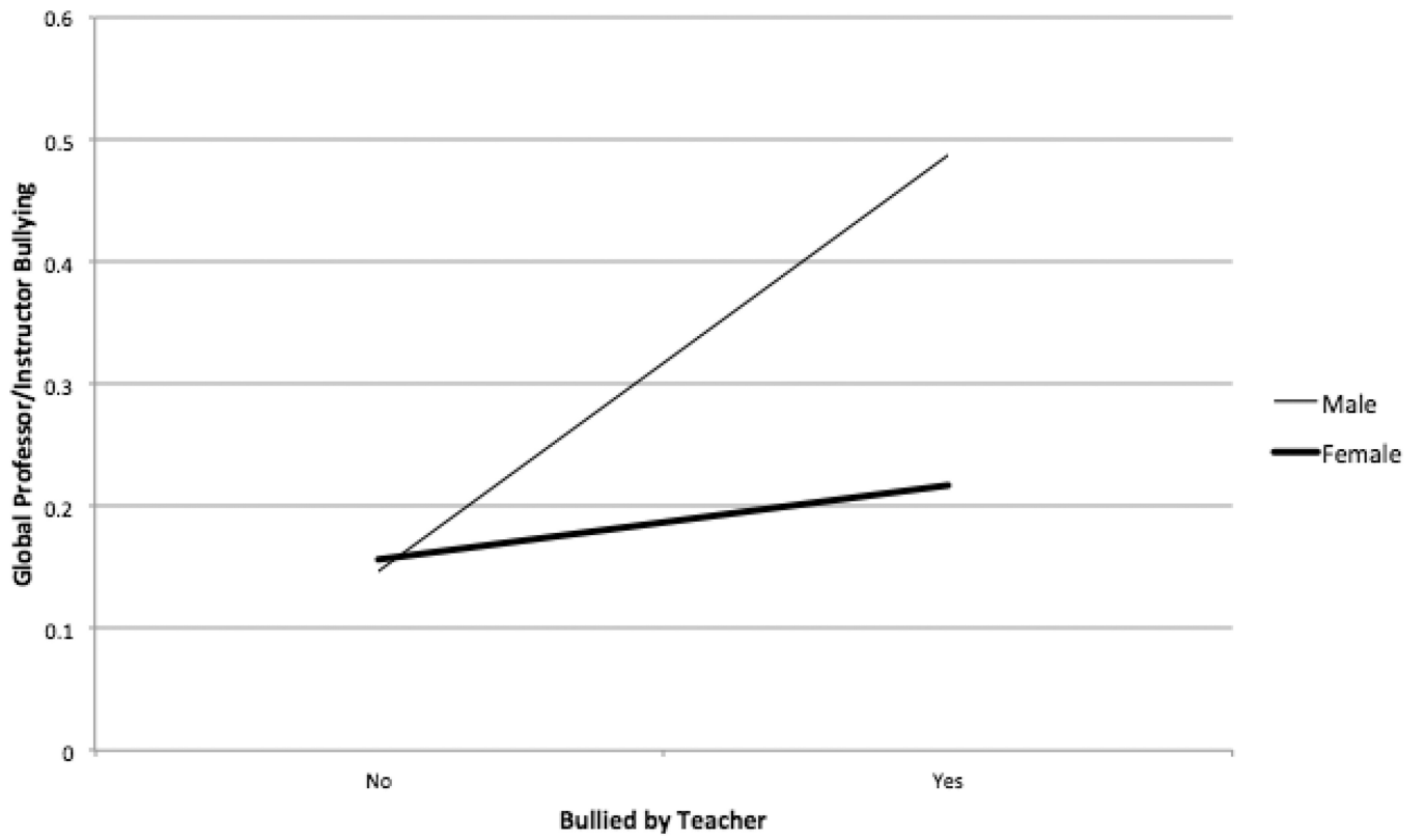
FIGURE 2. Teacher Bullying Interaction with Sex & Professor/Instructor Bullying