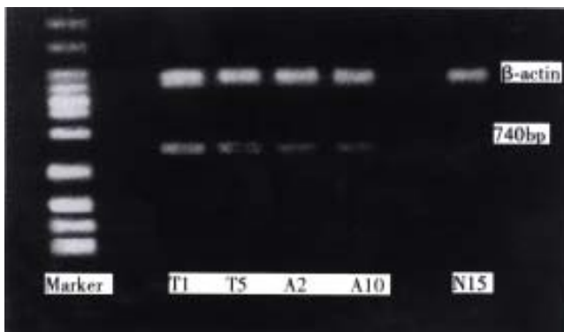
Figure 2 Electrophoretic pattern of RT-PCR product for CD44v in gastric tissues.