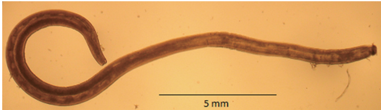
Fig. 1. An immature female worm of Angiostrongylus cantonensis collected from the human eye in this study.