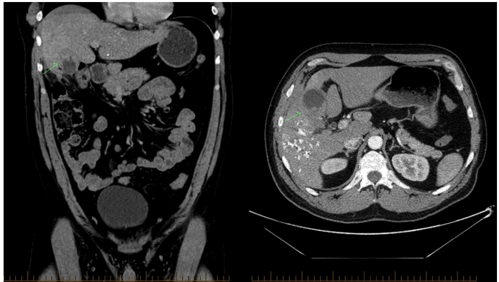
FIGURE 2: Initial staging CT of the abdomen and pelvis with contrast

Coronal (left) and transverse (right) view showing extensive gallbladder mass prior to starting chemotherapy.